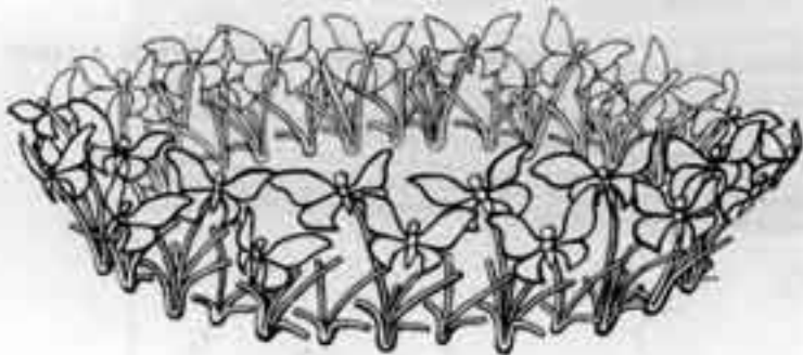
WEDDING CROWN © Merry Renk 1981

MERRY RENK, Goldsmith: "Animals have had strong personal meaning in my dreams for many years, and after working with images of family landscapes as well as single animals, it was a natural outgrowth to develop animal families as mandalas. These animal images are for me the freedom to express multi-layered concepts, including the cycle of life which one family represents. My jewelry has become a journal of families, dreams, places, and events. The wedding crown, "Butterfly Tree" reflects my happy memories of Monarch butterflies and the splendor of their clustering on the pine trees in Pacific Grove."