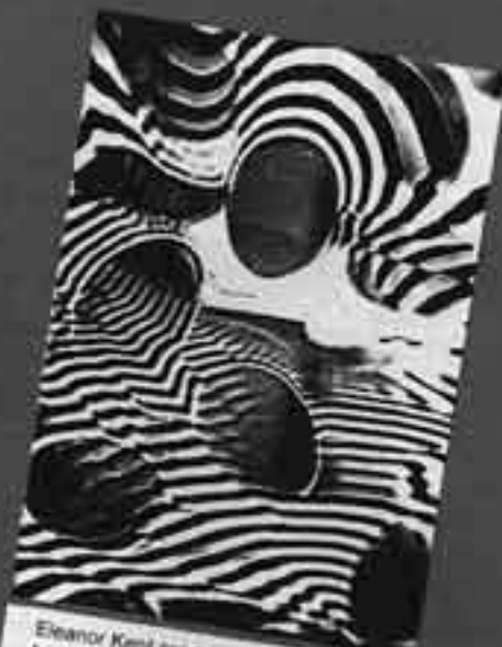
Eleanor Kent produced Zebra Eggs by laying eggs on the glass of a color Xerox machine, holding a mirror over them, and running the resulting image through Pict Production's Video Colorizer.