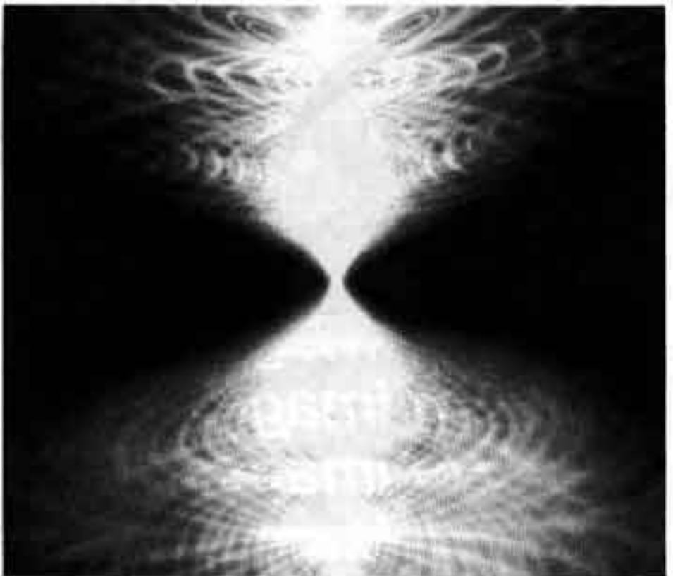
U. #36

After splashdown, we went our separate ways (save those who stayed for dinner).